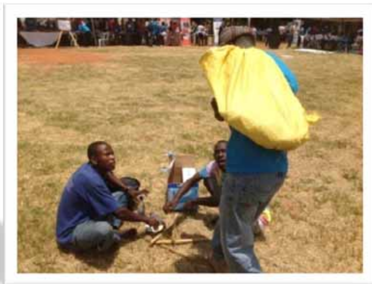
Refugees performing drama on the impact of Sexual Gender Based Violence and Persecution

During the launch, music, dance and drama group of the Refugee Law Project presented a drama on violence and its impact on individuals, families and communities at large.