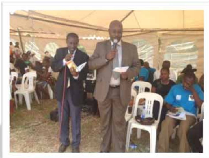
Apollo Kazungu, Commissioner for Refugees in the Office of the Prime Minister (OPM)

“In short, we here today are part of a bigger picture which includes culture, religion, law enforcement institutions, marriage and family, lower and higher institutions of learning, military, and police among others, to break the cycle of sexual violence to domestic violence, all these stakeholders need to change; pain is pain and nobody is immune to sexual violence. Please let us join hands to stand against SGBVP by highlighting the close connections between sexual and domestic violence, and by advocating for inclusive response mechanisms and non-discriminatory programming as well as involvement of all stakeholders. For God and My Country.”