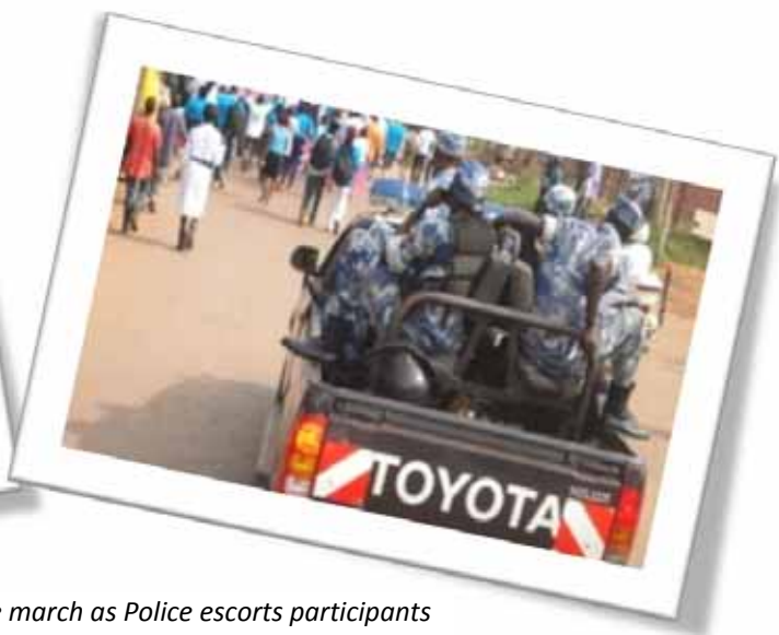
Prison's Brass Band leading the march as Police escorts participants