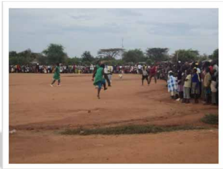
Women in Action: A friendly football match between women and men in Kotido. Women won 2 goals to nil

The event was successful and the day's activities were crowned with a friendly football match between women and men of Kotido where the women won with 2 goals to nil.