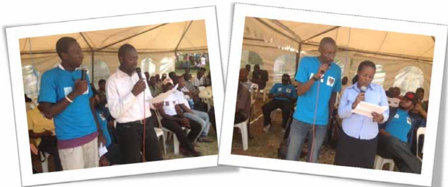
The President of Men of Hope and Deputy President Torture survivors association presenting speeches on behalf of support groups affiliated to RLP

Over the years, support groups have become an integral part of RLP's intervention strategy, this is especially in response to the increasing number of clients compared to staff providing services in the relevant offices; this strategy has been devised to ensure continued healing when organizational services which are often donor funded cease operations due to funding constraints. Over the years, RLP has helped establish sixteen support groups that are directly and indirectly affiliated to different thematic programmes.