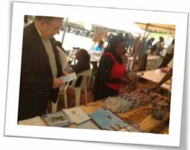
Participants during voluntary counseling and testing and exhibition of SGBVP related materials