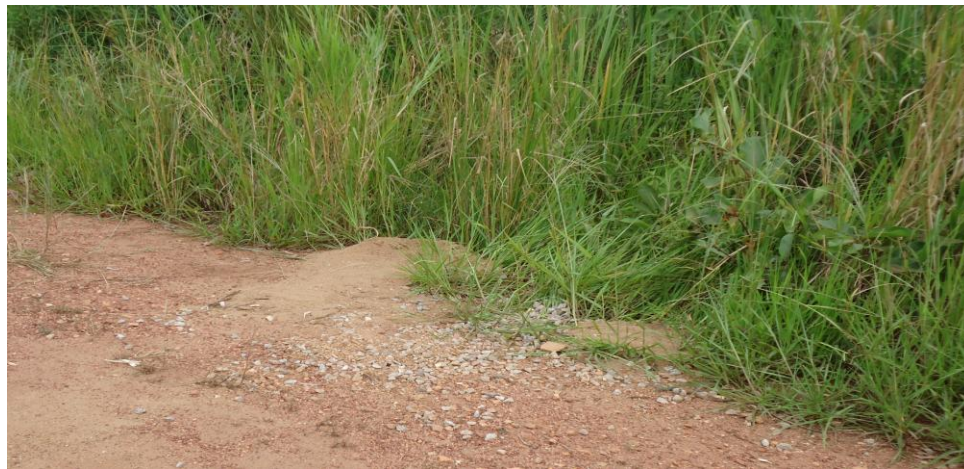
In the picture is remains of sand and gravels that was being mixed to cement – mark stones and sign post to separate Apaa from Amuru District