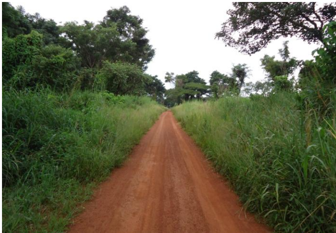
In the picture is the road from Amuru leading to Apaa

This brief entail issues relating to resettlement, land ownership, and boundary dispute between Amuru and Adjumani district. This brief in particular addresses the current land dispute playing out in Apaa village between the residents of Amuru and Adjumani districts. It also highlights and provides in-depth understanding of the conflict causes and triggers, and presents the conflict time line, key actors involved and recommendation. This brief has been as a result of ongoing ACCS contextual analysis and field visits carried out in Apaa from 22 nd to 25 th August 2012. ACCS concerted effort is to undertake contextual analysis and advocacy to strengthen the capacity of various stakeholders to respond to the pervasive and wide - spread disputes that have potentials of crippling recovery and sustainable peace in northern Uganda.