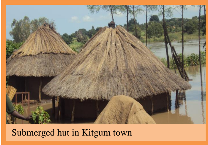
Submerged hut in Kitgum town

The traditional mud-brick architecture, common in the areas surveyed, is largely susceptible to damage by the wet conditions prevalent during flooding, and as such many people's shelters were destroyed. Families whose shelters were destroyed currently live in debilitating conditions, even sleeping in 'heaps of grass' and 'rocks'. For those who have abandoned their huts, some in a satellite-camp in Atura , are sharing one small hut (between 2-4 families ). People are also forced to cook outdoors and resort to drying their harvest on rocks and wet surfaces. Shelter kits containing tarpaulins, buckets, mosquito nets, blankets and tents are a necessity.