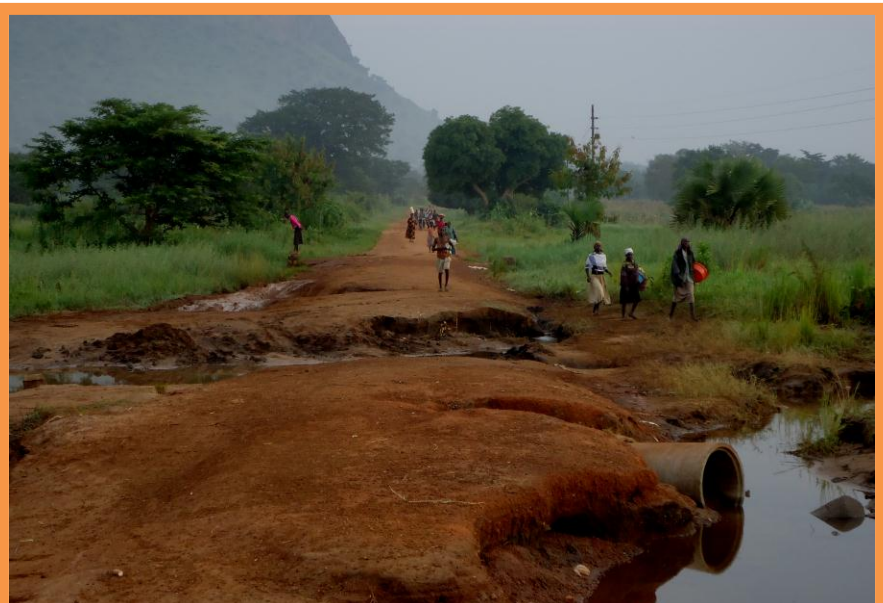
Damaged culvert on Kalongo—Pader Road

Roads, bridges and culverts were blocked and washed away. Whereas, the most affected roads in some areas were community access roads, that cannot withstand heavy rain, in other parts, central government roads were the worst affected. About 9 main roads and 75 feeder roads have been damaged in the districts of Agago, Pader, Kitgum and Lamwo. The main roads destroyed include: Kalongo—Paimol—Namokora Road,