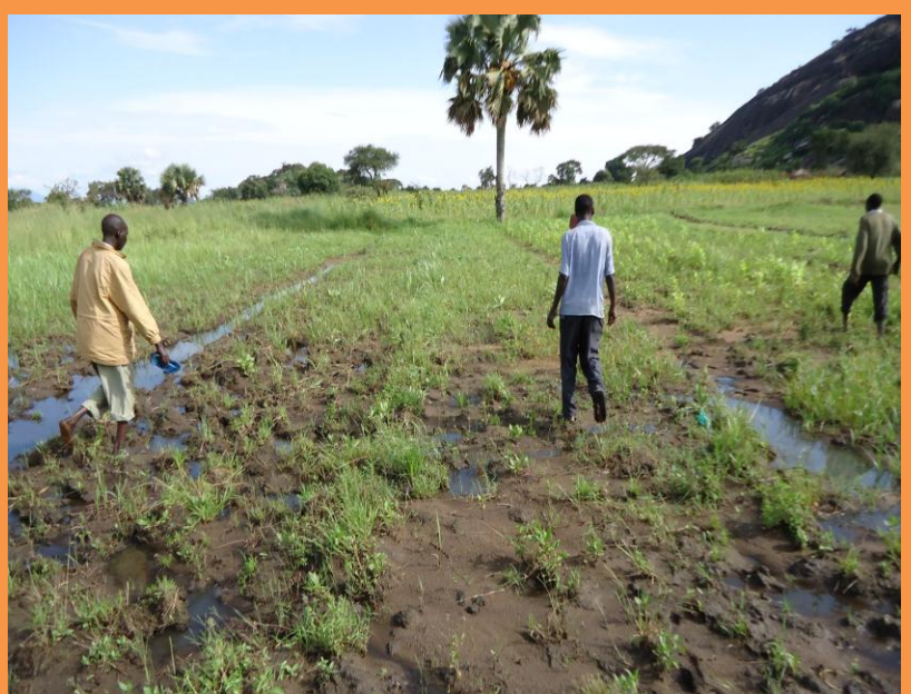
A flooded garden in Pakor Parish, Agago district

Numerous gardens were destroyed and several fields remain unreachable, thus, disrupting harvests and post-harvest handling. The most affected crops include: ground nuts, millet, sorghum, beans, simsim, cassava, sunflowers, rice and cabbages. Most crops have rotted in the field, while the harvested crops could not be dried (for preservation).