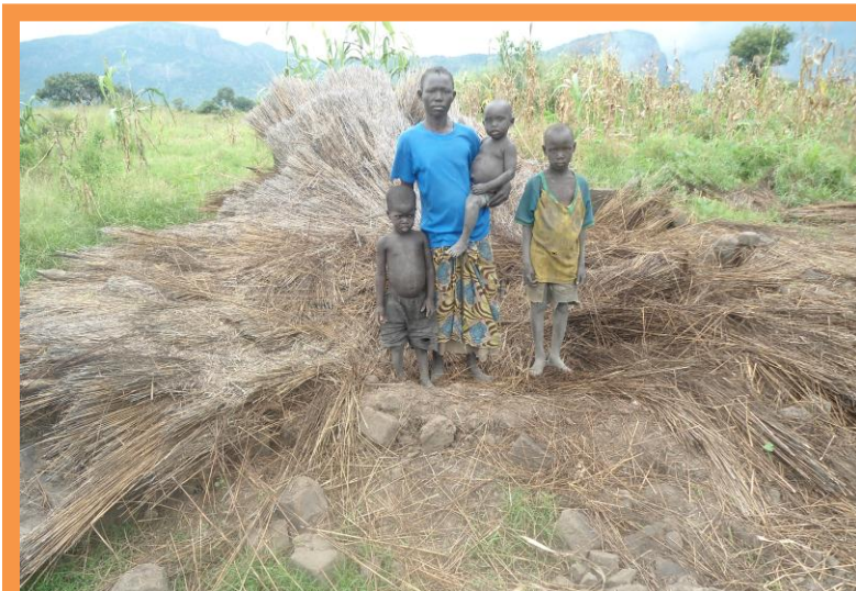
A family rescued from their fallen hut in Parabongo

Noting the impact on returnees, part of this vulnerable population was re-displaced by the floods. If their needs are not addressed in a timely manner, more risk being re-displaced to IDP camps, especially in flood prone areas such as: Wol and Adilang in Agago district; Atanga and Latanya in Pader district; Orom, Omiya Anyima, Namokora, Mucwini in Kitgum district and; Potika and